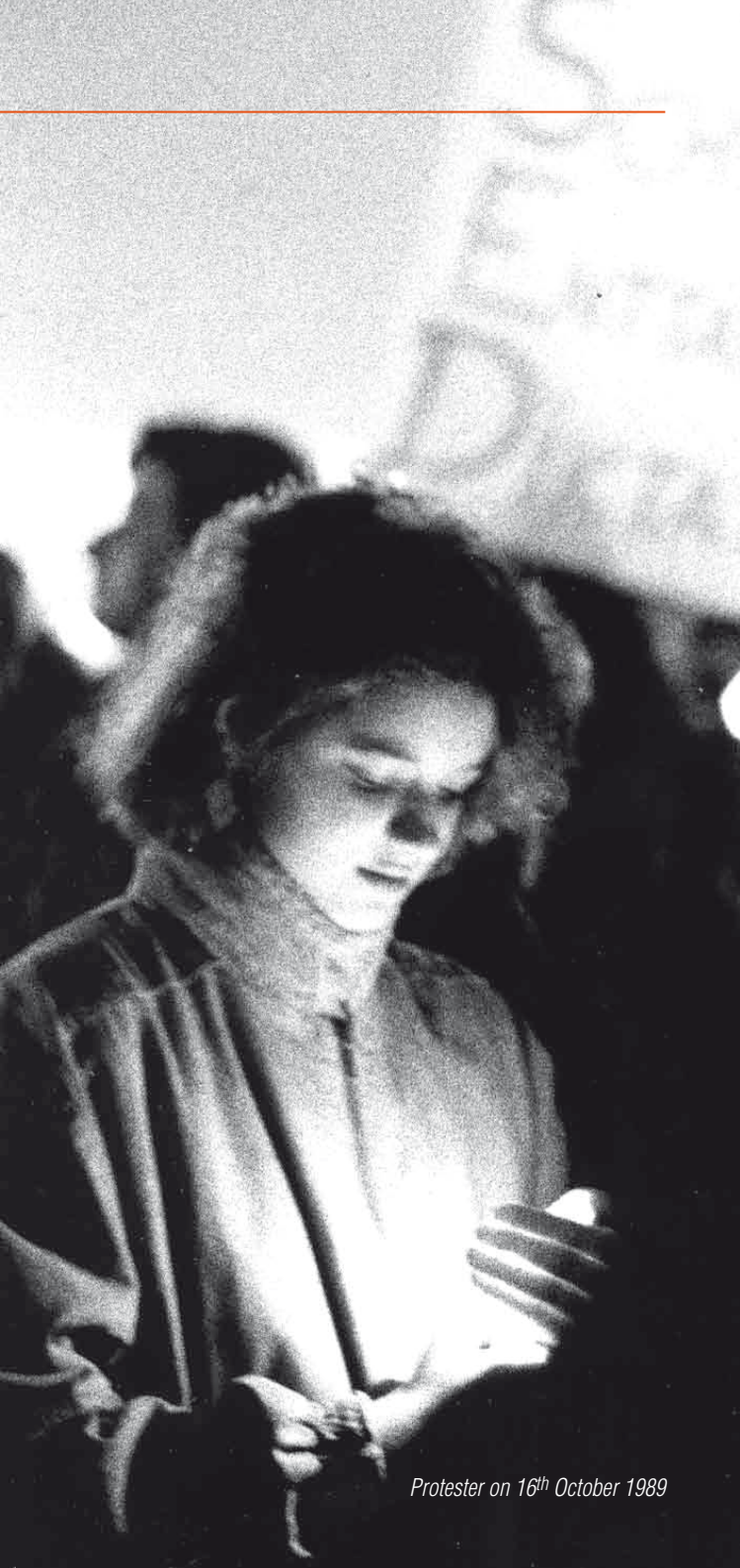
Protester on 16 th October 1989